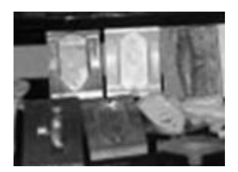
Fig.2. Examples of matrices obtained by the SLS.

One of the most important applications of selective laser sintering of metal powders for production of metal molds for injection plastics and alloys. The procedure is useful for mold complex shapes in the figure below are some examples of this type of mold. If metal molds with complex configuration is most advantageous use of the process of working on CNC milling machines.